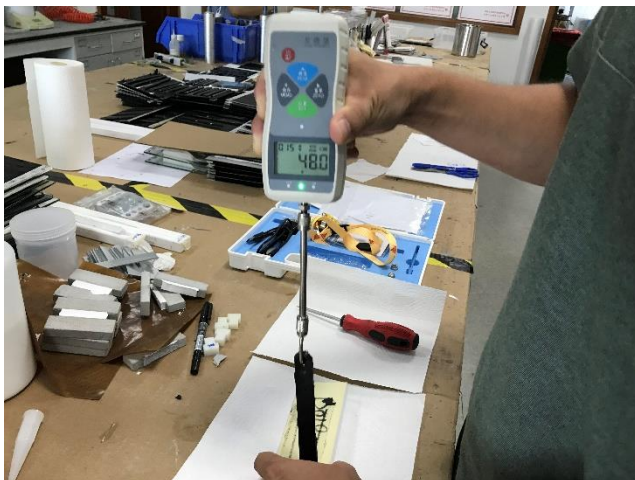
图1. Test result 测试结果